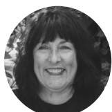
Marie-José Events 30 years experience