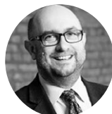
Josef Media & PR Germany 25 years experience