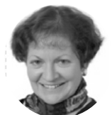
Joy Media & PR UK 23 years experience